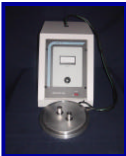
CEA carbon evaporation accessory