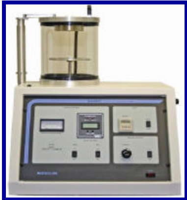
Hummer 6.2 + CEA and 6.6 - CEA compatible