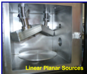
Linear Planar Sources