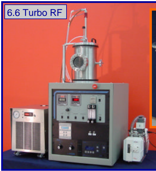
6.6 Turbo RF