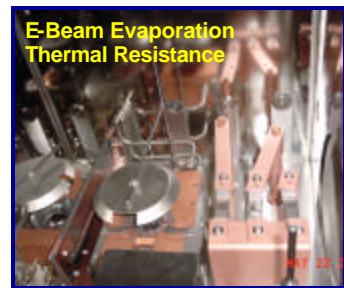
E-Beam Evaporation Thermal Resistance

16x16, 20x20, 24x24, and 30x30 - Inch Chamber Models