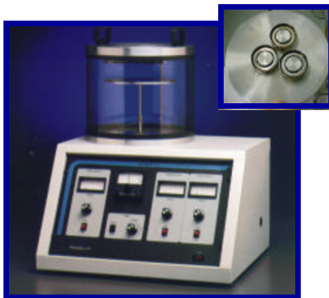
Hummer 8.0 with 3-Targets 3 Power Supplies