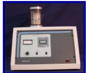
CDS-2.2 carbon deposition system